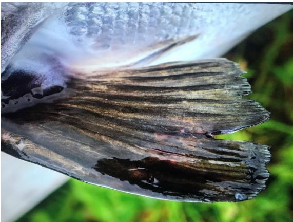
Damage to the pectoral fin