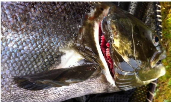
Shortened gill covers (gills visible)